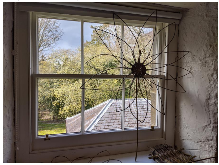
Some crafts made at our Willow Weaving workshop earlier this month.

You can buy tickets for our next two classical concerts, the Feis Rois Ceilidh Trail and much more! Check our <u>website</u> and contact us on <u>info@cromartyartstrust.org.uk</u> or pop by the office at Ardyne.