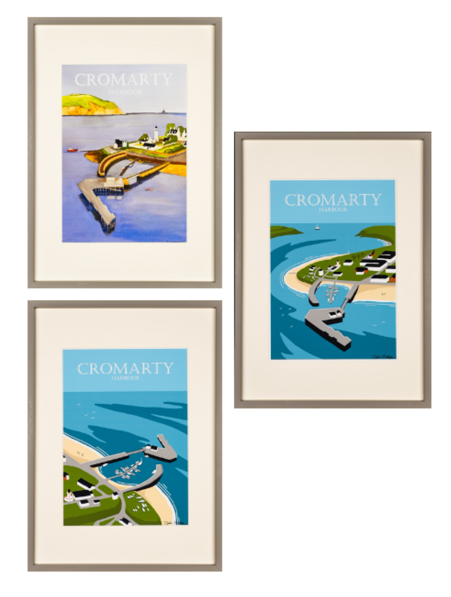
Newly launched (get it...?!) posters available to buy, with proceeds going towards the Cromarty Harbour.